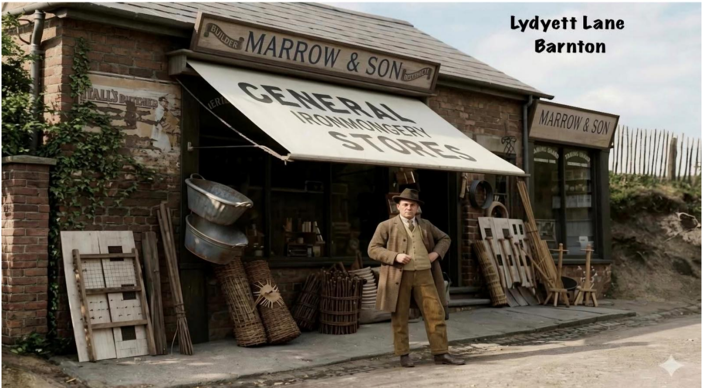
Lydyett Lane Barnton