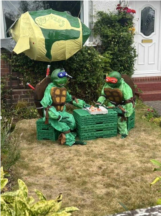
TEENAGE MUTANT NINJA TURTLES