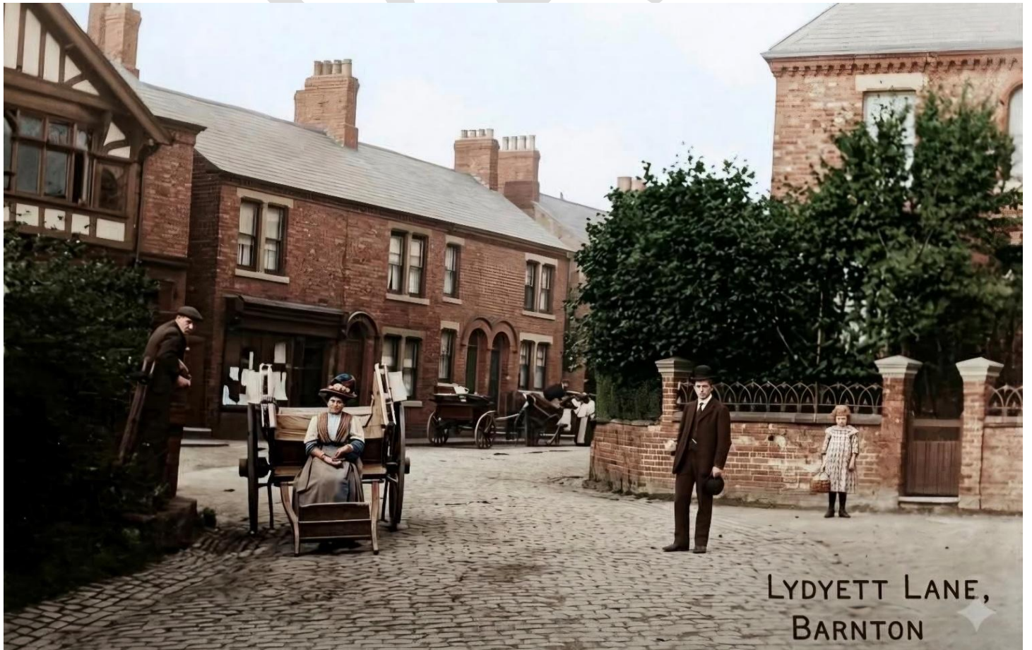
LYDYETT LANE, BARNTON