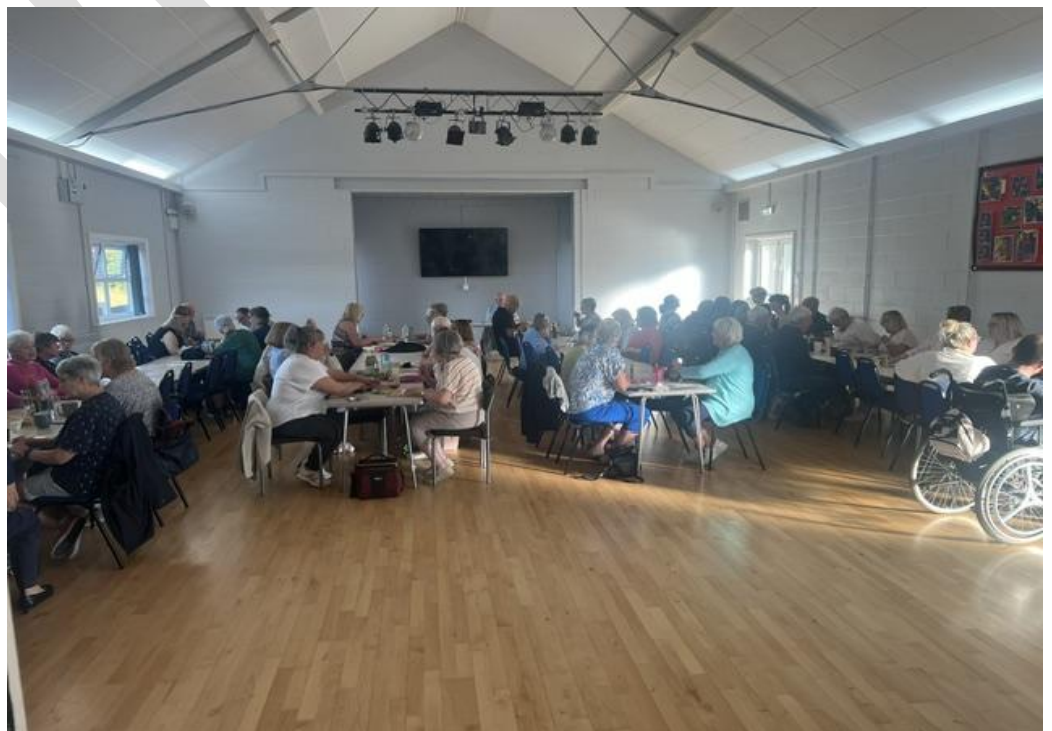
One of the BINGO sessions